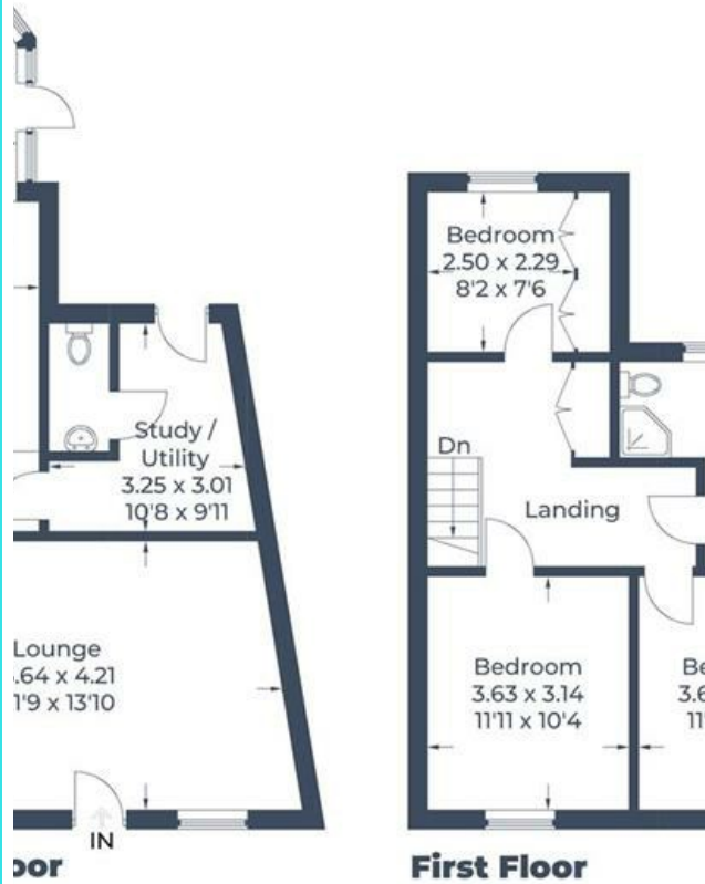
Illustration for identification purposes only, measurements are approximate, not to scale. © CJ Property Marketing Produced for Fine Homes Property

Approximate Gross Internal Area Ground Floor = 54.6 sq m / 587 sq ft First Floor = 47.7 sq m / 514 sq ft Total = 102.3 sq m / 1,101 sq ft